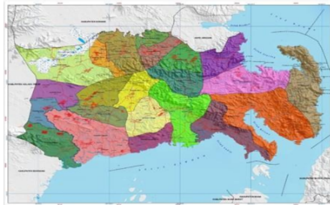
Fig. 1. The study site [12].

Wolasi were 70 households (5,9% of total population), in the District of Baito were 156 households (13,2%), in District of Kolono were 67 households (5,7%), and in the District of Laeya were 116 households (8,61%). The research was conducted on May-July 2016.